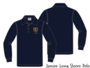
Junior Long Sleeve Polo